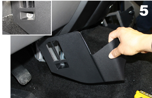
Remove (1) 10mm screw holding the lower trim in place rotate over the transmission hump and unsnap from the passenger side.