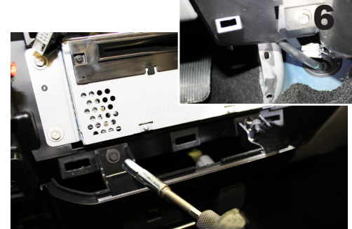
Remove lower panel containing 12 volt power and USB by unscrewing (2) 7mm screws on the top and (2) 10mm screws on the bottom. Unplug accessories from harness.