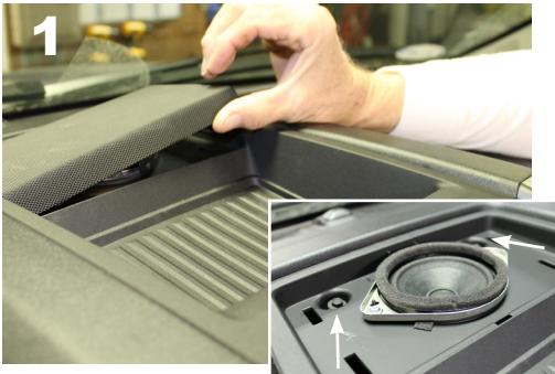
Unsnap speaker cover from each side corner to remove (2) 7mm screws.