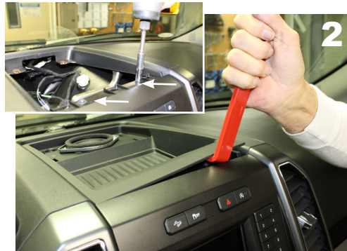
Pry the top tray up from each front corner and remove the (2) 7mm screws. Unplug speaker from the harness.