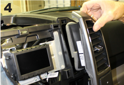
Remove the left and right climate sections containing the 12" volt plug and the 4x4 knob selector, unplugging each from the wiring harness.