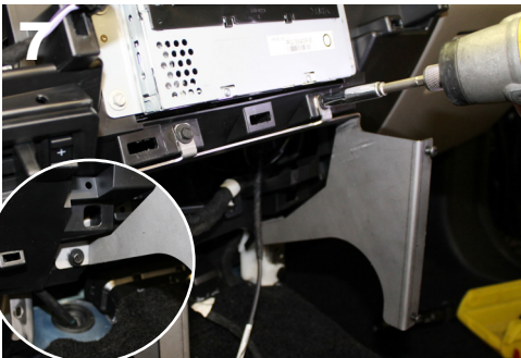
Install the Console Support Bracket with the previously removed 7mm and 10mm OEM screws from step 6.