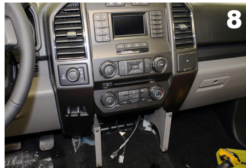
Replace trim components that were removed in steps 1, 2, 3 and 4.