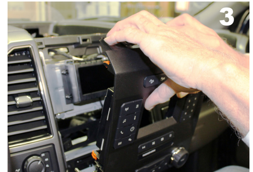
Pry from the top to unsnap the trim covering the radio and climate controls. Unplug the heater control from the harness.