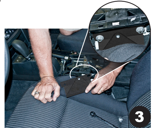
3 Install mounting brackets using the 13mm OEM nuts from previous step. Making sure to use the correct bracket on each side. Large hole on bracket goes toward rear of console.