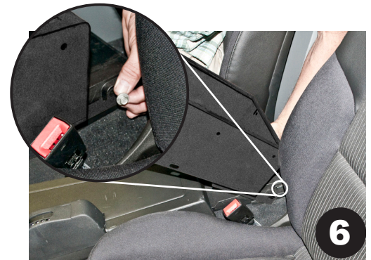
6 Install Caprice console by sliding rear extended brackets under plastic flange piece of OEM floor plate. Then push downward to seat the Caprice console onto the OEM console making sure the mounting brackets sit inside console. Secure rear extended brackets using 10mm OEM bolts. One per side.