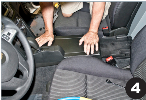
4 Replace OEM Console and clips. Refer back to step one for clip location.