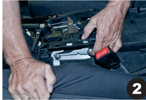
2 Remove 13mm nuts from the side of the transmission hump between seats and console. Two per side.