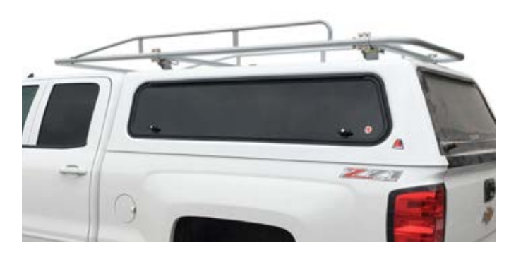
Medium-Duty Pro III Steel & Aluminum Racks

1 6" Taller Legs for High-Rise Caps - 01110 Only